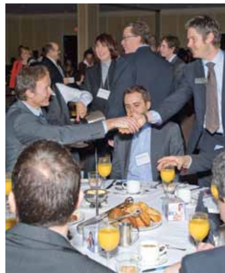
Guests enjoy some time to network at the sixth annual fundraising breakfast

Funds raised from the breakfast will go towards much needed student supports and services, scholarships and bursaries as well as technical