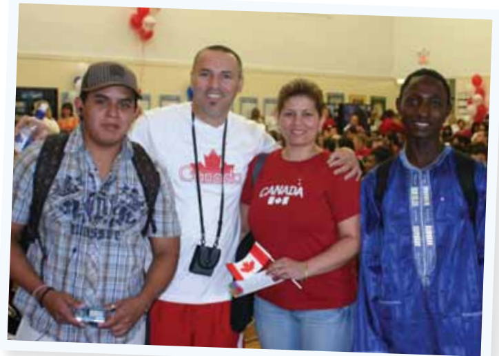
Westmount students celebrate Canada Day

"RBC supports NorQuest College's Centre for Excellence in Intercultural Education and the RBC Student Ambassador program because NorQuest provides new Canadians with the support, education