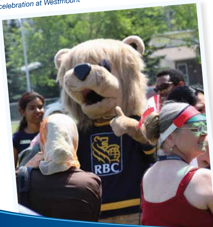
Leo the lion joins the fun at the RBC sponsored Canada Day celebration at Westmount

With their donations, the RBC Foundation has not only made an investment in our community's future, they have been an inspiration for countless others to do the same. That's a partnership that makes us all stronger.